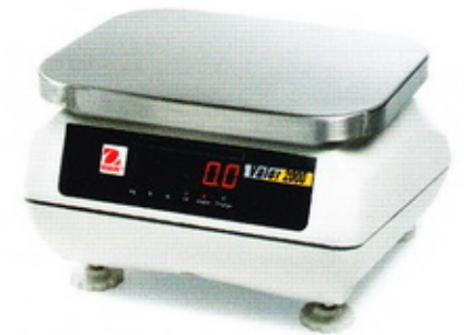
Valor 2000 with rear LED display