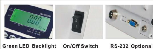
Green LED Backlight On/Off Switch RS-232 Optional